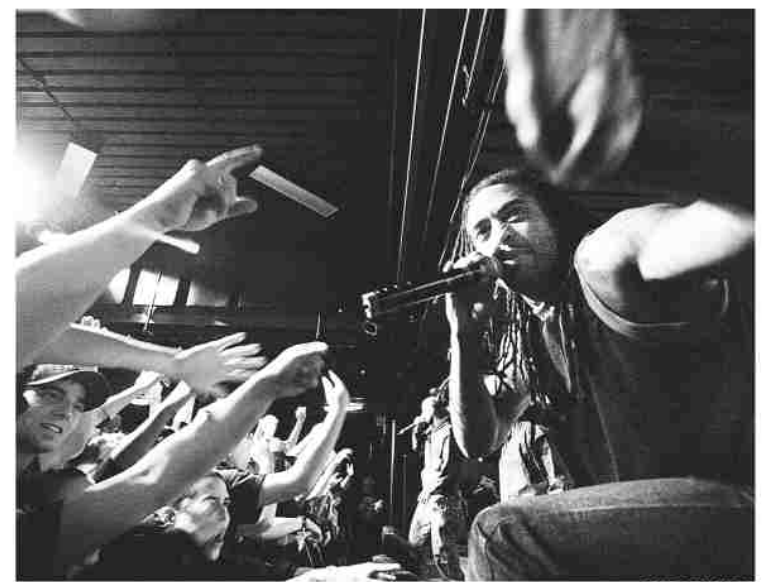
PREVAIL! Swollen Members took their act to Dinwoodie Lounge on Wednesday.